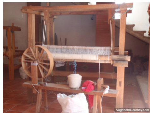
old spinning wheel and loom

All of Sarah's grandchildren delighted in watching Sarah using the old spinning wheel. They would watch as her feet would tap while she was spinning. Sometimes she would brush the lint from her white apron and do a quick step dance right there for the kids to watch. The grandkids often held the spindle while Sarah spun the silk strands. They were always rewarded with cookies or cake after.