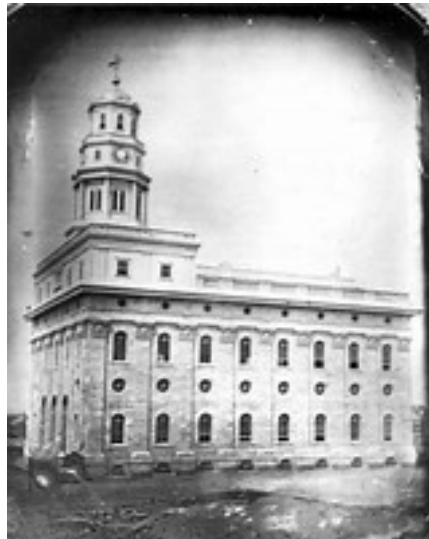
Early daguerreotype of the Nauvoo Temple

The family donated most of the money they earned toward the building of the Nauvoo Temple and to pay for the land the city was built on.